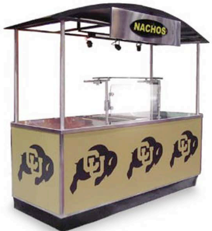
Nacho Cart shown with custom graphics and canopy.