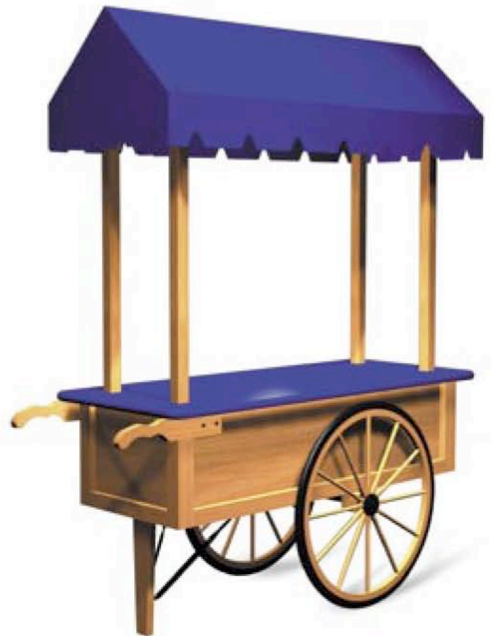
5 ft Slimline Cart shown with standard awning. Custom awning available.